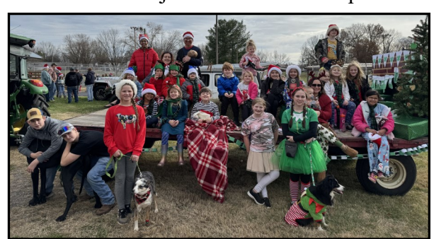
Top Dog & Cloverbud Clubs

Congratulations to the following clubs who prepared parade entries to promote 4-H and their clubs: The Horse Club participated in the Bowling Green Christmas Parade and received the Judge Executives Award. Cloverbud and Top Dog 4-H Clubs participated in the Woodburn Christmas Parade. The Cloverbud Club received 2<sup>nd</sup> place in the float division. All of these clubs did an excellent job! Check out their pictures: