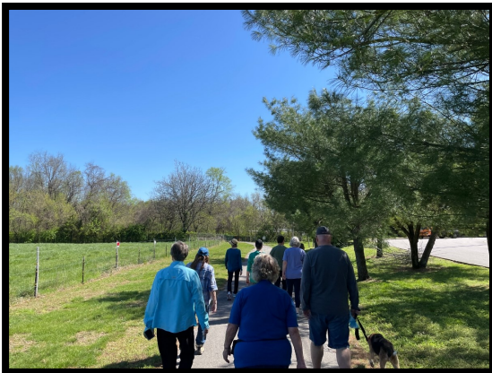
Let's Walk Warren County participants enjoying the Kereiakas Park Greenway Trail.

track of their progress. The State of Childhood Obesity reported that adults in Kentucky have one of the highest percentages of physical inactivity, 30.1%.