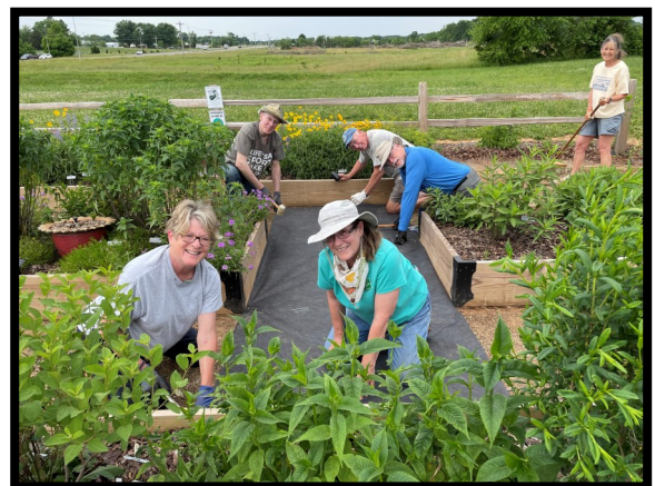
Extension Master Gardener Certified Monarch Waystation