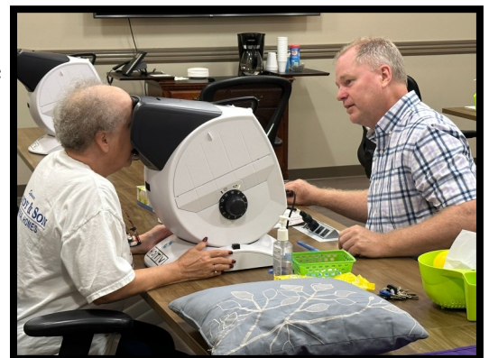
Participant receiving a free eye exam.

The event planted seeds of hope and importance for the participants. A quote from one participant, "I had such a wonderful time tonight. It lifted my spirits. This really did help heal my heart."