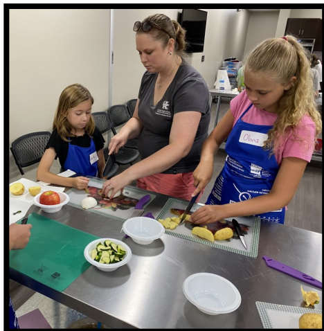
Youth cutting vegetables at Super Star Chef Camp.

Kentucky has the fifth-highest rate of obesity in the nation. Approximately 17 percent (or 12.5 million) of children and adolescents ages 2-19 years are obese (Data from the National Health and Examination Survey). To combat high obesity rates for elementary and middle school children the Warren County 4-H Youth Development agents partnered with Potter Gray Elementary School to provide 8 cooking lessons to 80 3rd-5th grade students. Through the school year the 4-H agents and volunteers also offer two 4-H