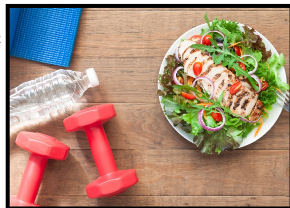
Healthy lifestyle behaviors

Results - In 2022, 95% of adult participants made a positive change in food group choices and 78% showed improvement in one or more food safety practices. In addition, 92% showed improvement in one or more food resource management practices and 65% made changes to be more physically active.