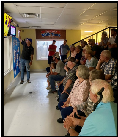
Cattlemen visit Chaney's Dairy Barn to learn about the robotic milker.